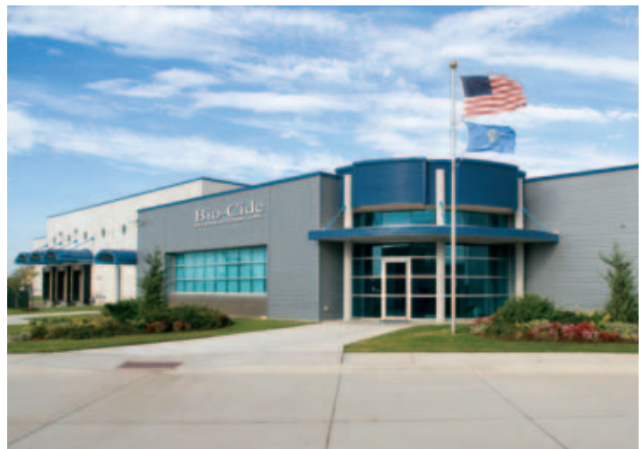
Bio-Cide International, Inc. the worldwide leader in Chlorine Dioxide technology.